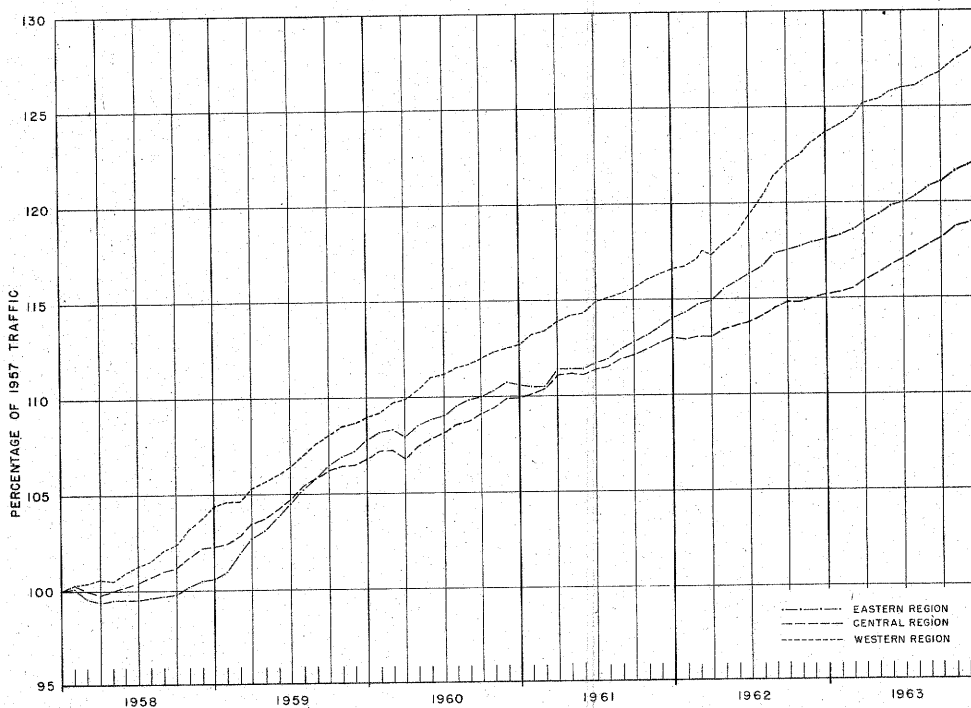
FIGURE 3 — TRAVEL ON MAIN RURAL ROADS BY 12-MONTH PERIODS ENDING EACH MONTH, AS A PERCENTAGE OF TRAFFIC IN THE CALENDAR YEAR 1957