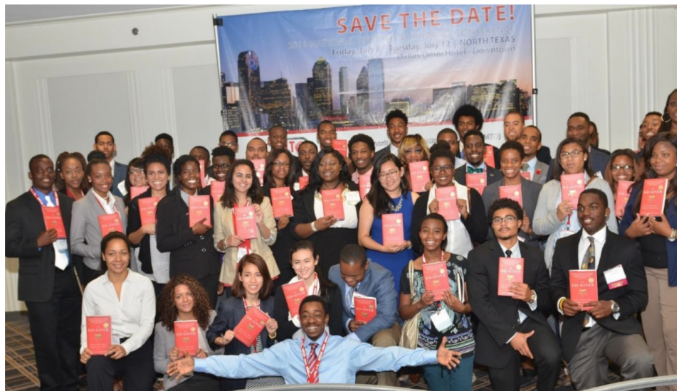
Workforce Development Student Internship Program participants