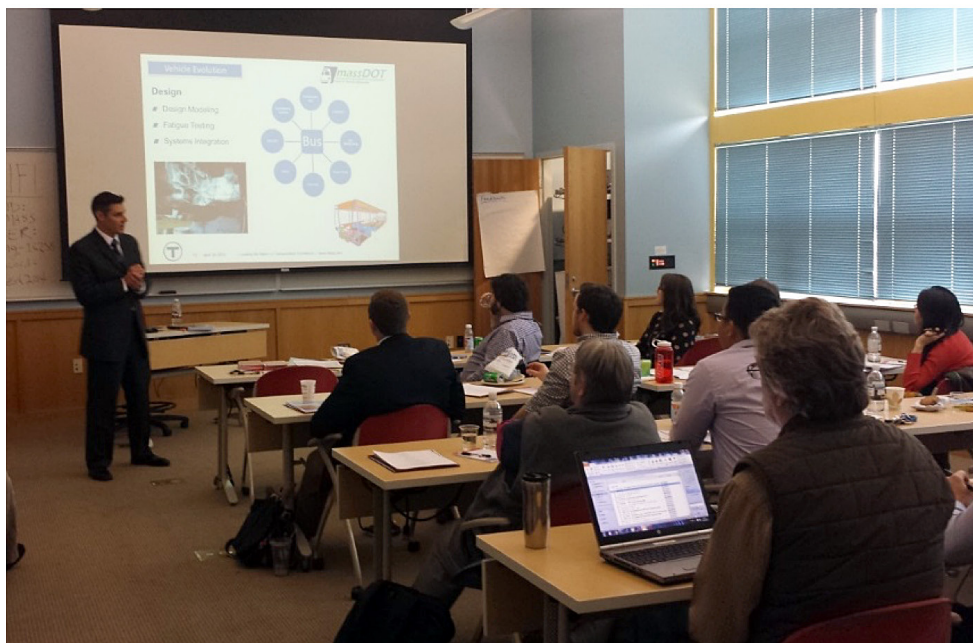
University of Massachusetts Transit Certificate Program participants

UMass Transit is a university-operated transit system serving students, faculty, and staff on campus and in surrounding areas. On average each year, it has 150 student drivers, with a 40% turnover rate. It has become adept at training student commercial driver license (CDL) drivers and has an agreement with many local transit operators, such as Connecticut Transit, that provides student drivers opportunities to pursue transit careers after graduation.