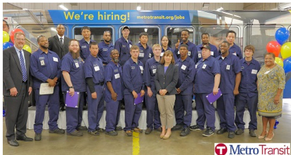
FTA Metropolitan Council/Metro Transit, Mass Transit Technician Program graduates