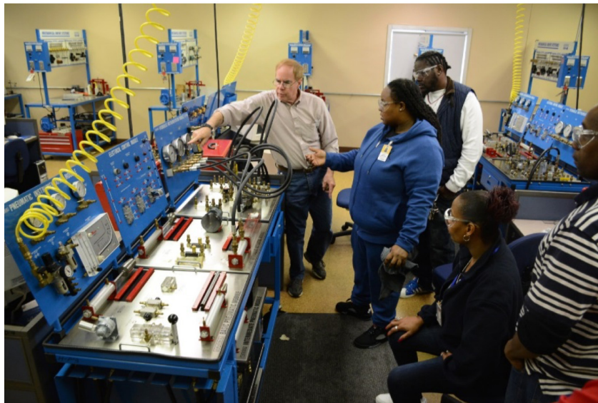
Basic Mechanic Training, Chicago Transit Authority, Second Chance Program

Last, Helfer discussed “Readiness Assessment for the Development of Career Pathways in Transportation,” an assessment tool meant to be used in combination with the Guide for the Establishment of Career Pathways in Transportation . The tool is organized around six key elements: building cross-system partnerships and a common vision; engaging employers and aligning pathways with industry needs; redesigning programs; pursuing funding, sustainability, and scale; pursuing needed policies and policy changes; and identifying and implementing cross-system data and accountability.