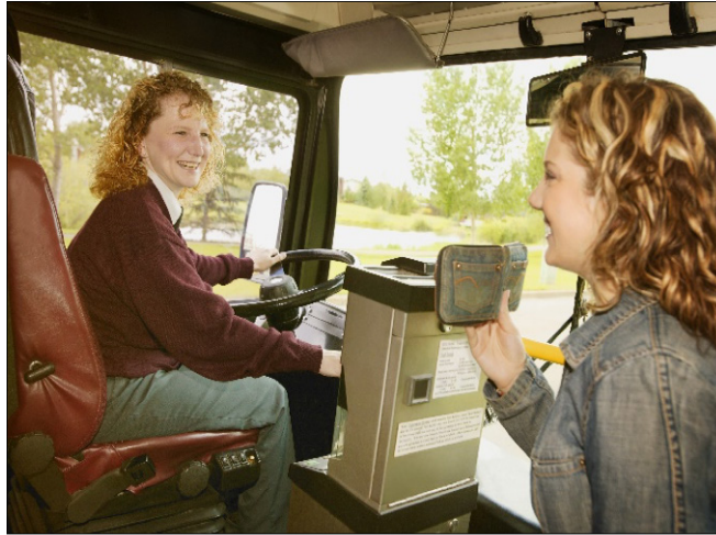
Strengthening Skills Training and Career Pathways across the Transportation Industry projects about 200,000 total job openings for transit and intercity bus drivers between 2012 and 2022.

Vehicle operators account for the largest job growth in transit. The report projects about 200,000 total job openings for transit and intercity bus drivers between 2012 and 2022. Lesser but significant growth in demand is also projected for mechanics and dispatchers. Most (89%) of projected job openings are in operations, with the next largest share (5%) in maintenance. Helfer presented workforce data at a national level and stressed that organizations need to collect and understand the data for their specific organizations and local communities.