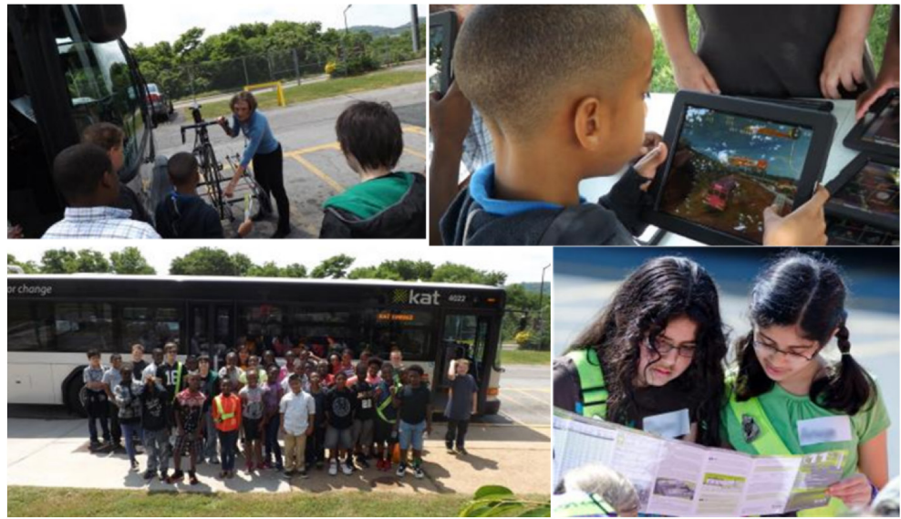
5th Grade Transit Days Activities

Establishing the necessary partnerships with schools and transit agencies to accomplish this program can be a challenge. Enix explained that that, fortunately, they had previously-established relationships with teachers in the school system and built relationships over time through previous grants. The schools targeted also were located along transit lines, so transit was a familiar sight.