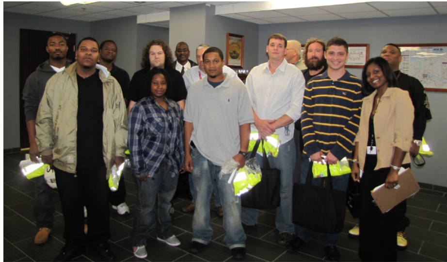
New Orleans Regional Transit Authority Streetcar Maintenance Program participants on the first day of orientation