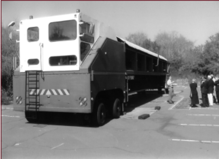
Figure 7. The team recommends developing a national mechanism to evaluate innovative products and processes for pavement preservation.

The team encourages agencies to review their design practices for chip seals and consider placing them on base or subbase courses to prevent moisture infiltration. To prevent moisture infiltration and capillary action, the Australians often place a chip seal on the base or subbase before applying the asphalt surface. This technique is especially useful on highly moisture-susceptible bases and subbases. The Australians also perform designs to optimize application rates for the type and grade of aggregates and bitumen used.