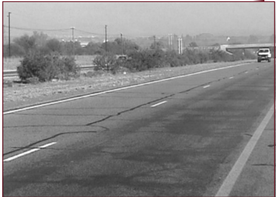
Figure 6. The team recommends application of chip seals earlier in the distress cycle to prevent premature pavement failure.

The team encourages agencies to review their specifications and upgrade them where appropriate so that superior aggregates are used and improved service life is accomplished. The success of chip seals in all the countries visited is due in large part to the high quality of the aggregate and the emphasis placed on design. High-quality aggregate (clean, less than 0.05 percent passing the 200 sieve, LA abrasion of less than 15, and micro-duval less than 20) of a single size is routinely used. In many instances, aggregate is hauled great distances, more than