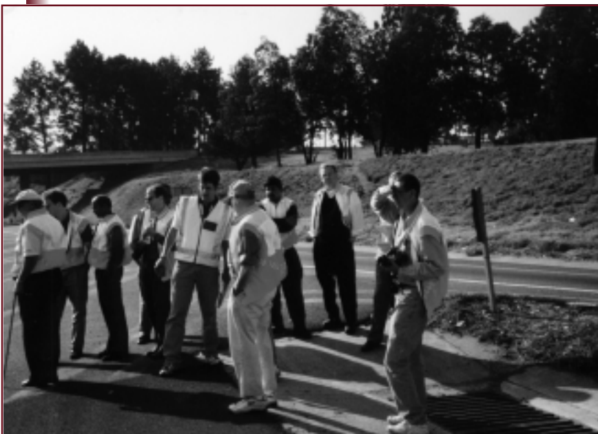
Figure 3. The team visited sites where pavement preservation treatments have been applied.