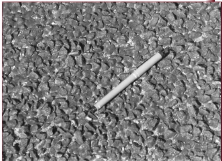
Figure 5. Australia uses a technique of pre-coating aggregates for chip seals to reduce aggregate loss.