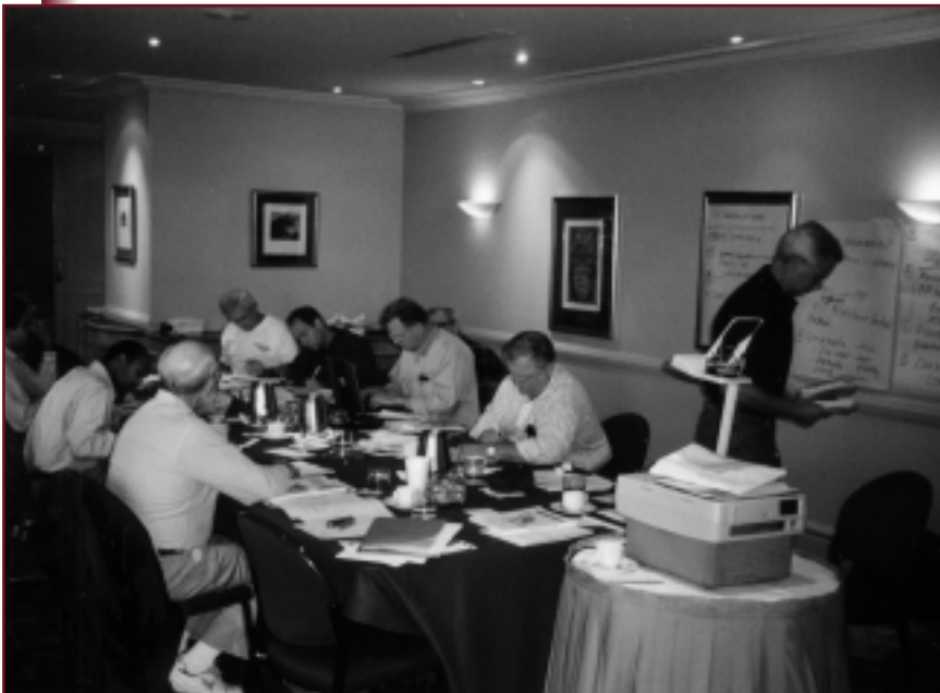
Figure 2. Team members met frequently during the tour to share observations.

Team members developed a list of amplifying questions (Appendix C), which was sent to each country before the study. These questions provided the host countries with an understanding of the topics of interest to the U.S. team and enabled the hosts to plan their presentations and site visits accordingly. The amplifying questions focused on four major topics: