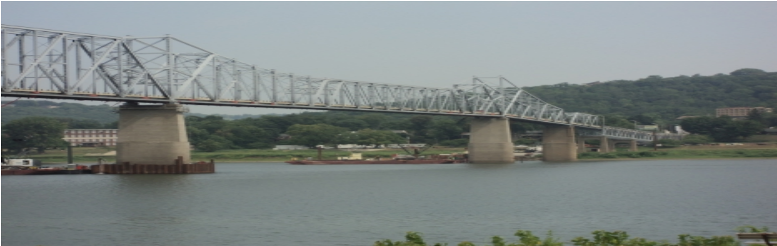
Replacement Bridge Under Construction Using Truss Sliding