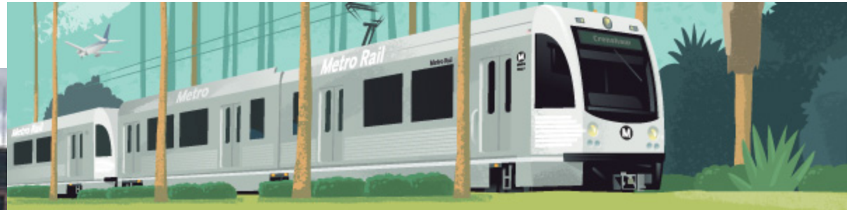
Crenshaw-LAX Transit Corridor (Los Angeles, California) TIGER II, $20MM