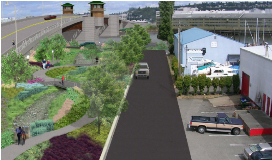
South Park Bridge Conceptual Design