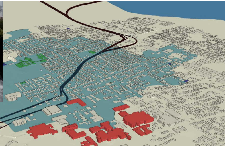
Charleston Infrastructure Needs