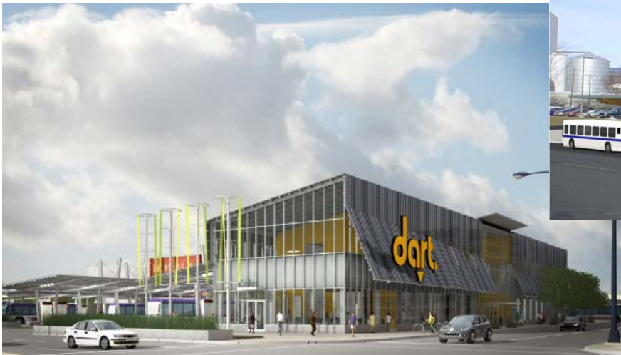
Des Moines Multimodal Hub (Des Moines, Iowa) TIGER II, $10MM