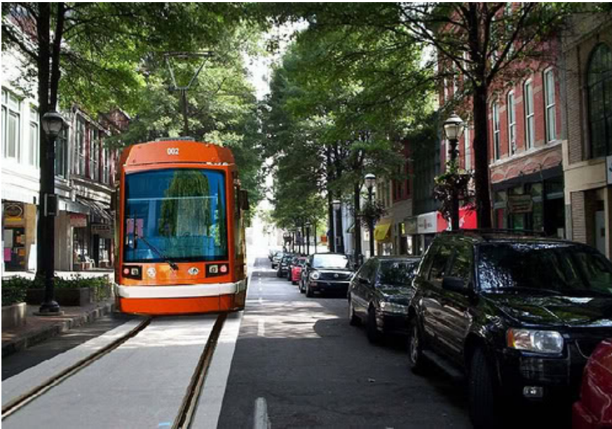
Atlanta Streetcar (Atlanta, Georgia) TIGER II, $47.7MM