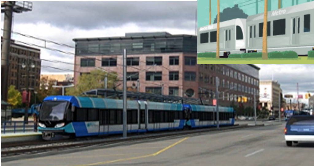
Woodward Avenue Light Rail Transit (Detroit, Michigan) TIGER I, $25MM