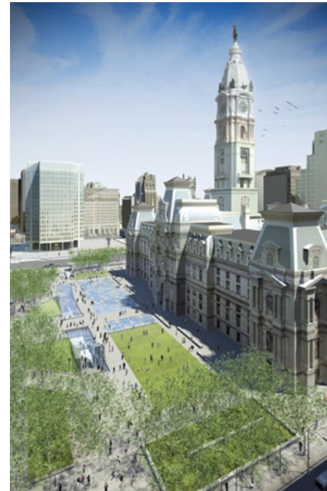
Dilworth Plaza & Concourse Improvements (Philadelphia, PA), TIGER II, $15MM