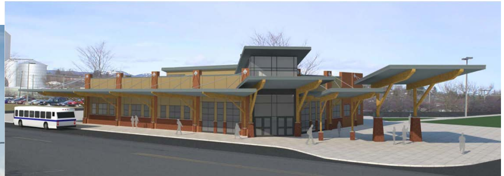
Moscow Intermodal Transit Center (Moscow, Idaho) TIGER II, $1.5MM