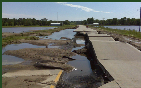
IA 1 flood damage by Cedar River near Mount Vernon, June 2008.