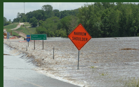
Close-up of I-80 overtopping at the Cedar River east of Iowa City, June 2008.