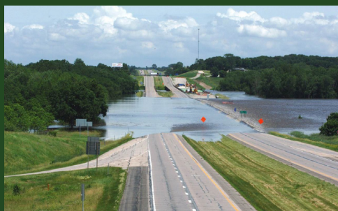
I-80 overtopping at the Cedar River east of Iowa City, June 2008.