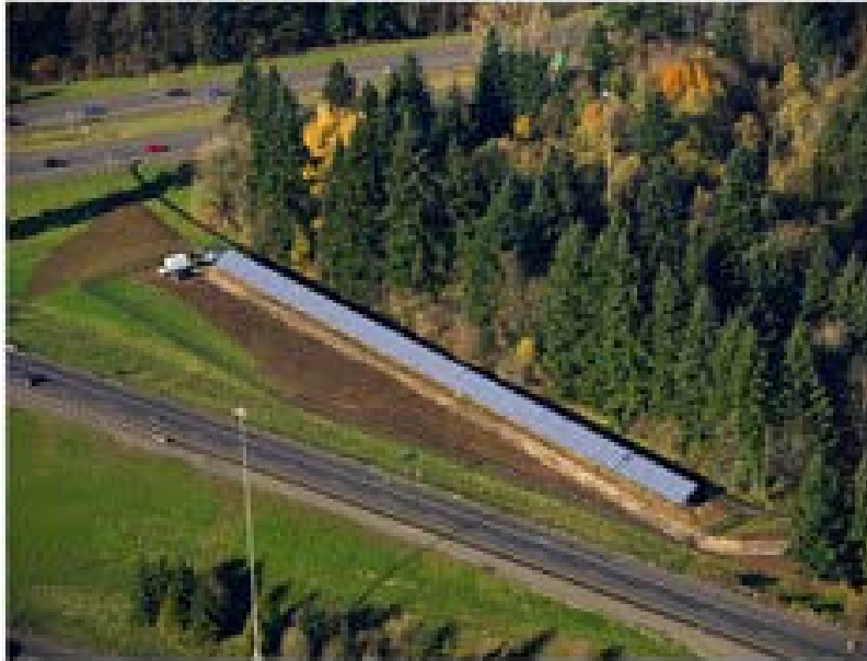
Oregon Solar Highway Demonstration Project