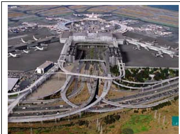
San Francisco International Airport in the 21 st Century

December 1998, the estimated cost for the Project was $210 million ($122 million for fixed facilities and $88 million for operating systems) and expenditures were nearly $53 million ($52 million for fixed facilities and approximately $1 million for operating systems).