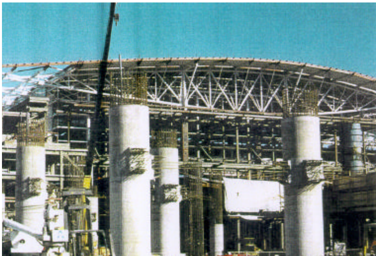
BART Construction at San Francisco International Airport

BART is an independent public agency providing heavy rail mass transit passenger service in the San Francisco Bay Area. The 8.7-mile BART Extension to the Airport originates at the existing Colma station and will terminate beyond the Airport at a new Millbrae station. The Extension includes a 0.8-mile On-Airport Project (Project) linking the Airport's new international passenger terminal with the BART