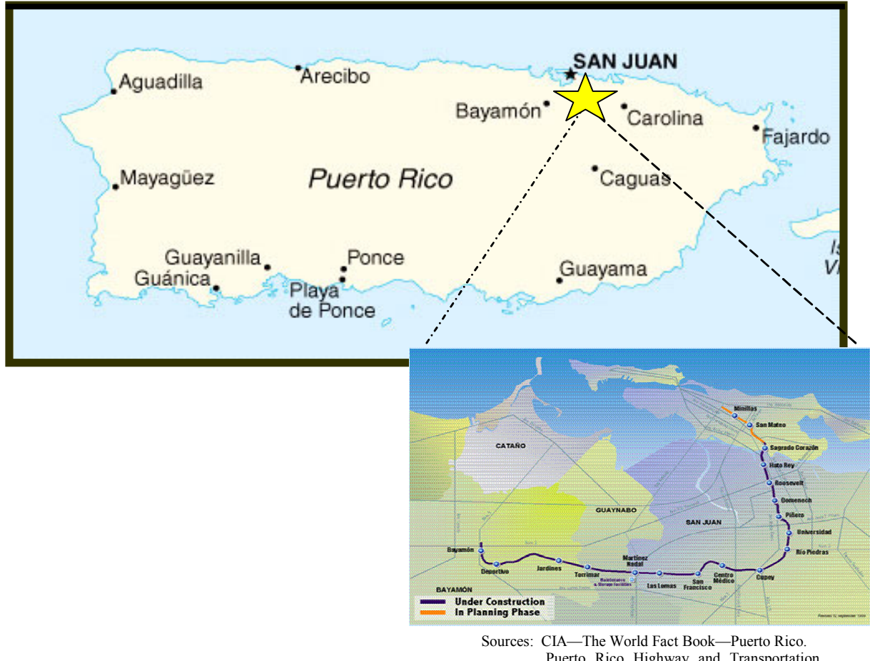
Puerto Rico Highway and Transportation Authority.

The project is the first mass transit system for Puerto Rico and will serve the San Juan metropolitan area with an L-shaped alignment. Tren Urbano includes 16 stations located between the westerly municipality of Bayamón and Santurce, a community in the municipality of San Juan. The fixed guideway is predominately elevated or at-grade with a 1.12-mile (2 km.) tunnel in the Río Piedras district, near the University of Puerto Rico and high-density residential and commercial