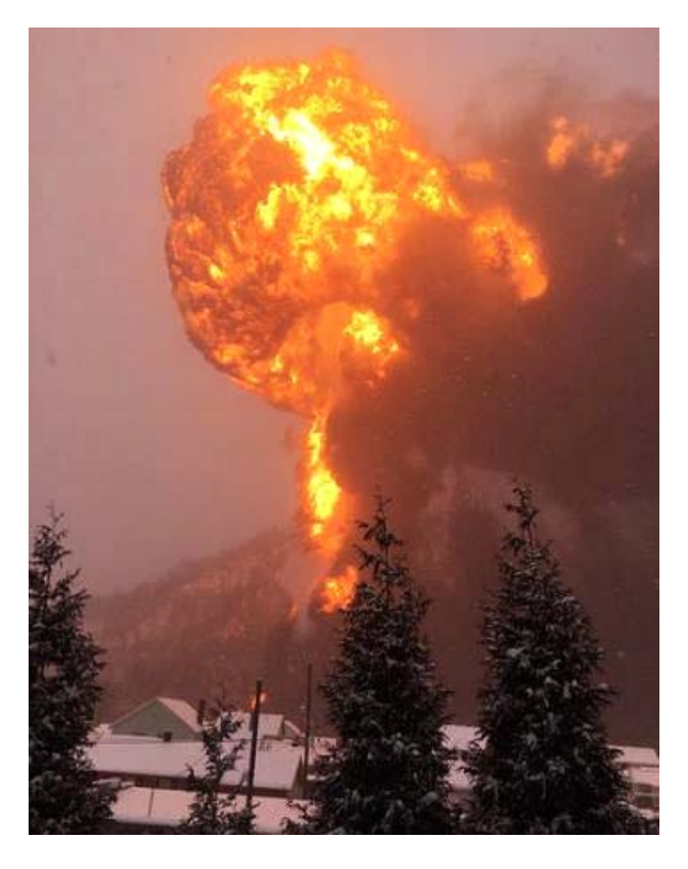
Figure 1. Fireball eruption from Mount Carbon, West Virginia derailment scene, February 16, 2015.

Emergency responders reported that the first thermal failure occurred about 25 minutes after the accident. By about 65 minutes after the accident, at least four thermal failures with energetic fireball eruptions had occurred (see Figure 1). The 13th and last thermal failure occurred more than 10 hours after the accident.