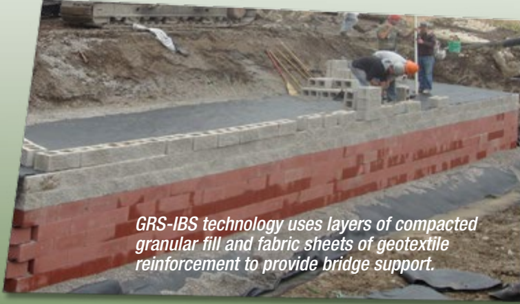
GRS-IBS technology uses layers of compacted granular fill and fabric sheets of geotextile reinforcement to provide bridge support.

Intelligent compaction is a modern approach to compaction of pavement materials, an important construction process that enhances pavement quality and performance. IC uses special vibratory rollers equipped with accelerometers, an integrated measurement system, GPS-based mapping and an onboard computer reporting system. Using IC can accelerate project delivery as well as improve quality.