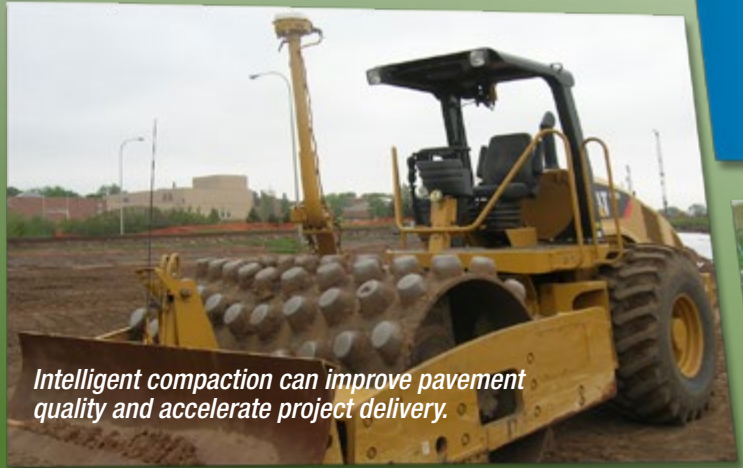
Intelligent compaction can improve pavement quality and accelerate project delivery.