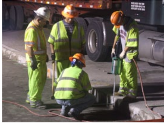
Using precast concrete pavement systems technology allowed crews to install panels quickly during limited closures.

The Virginia DOT used a unique contracting approach on the project, limiting the total contract value to $5 million and asking contractors to bid on required and optional repair areas. “When limited funding is available, it is possible to derive the highest value by selecting the contractor offering the largest scope during the bidding process,” said the FHWA report.