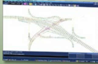
With 3D modeling software, project teams can connect virtually to collaborate on designs throughout the design and construction phases.