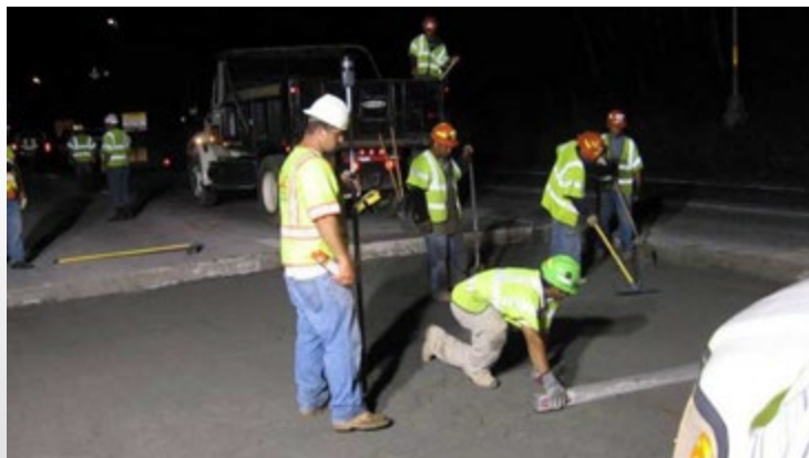
Crews worked at night to limit traffic disruption when they rehabilitated pavement on a busy Virginia interstate.

The project also demonstrated the value of good preparation and planning in achieving success, according to the report. Trial installations helped the Virginia DOT evaluate and become more comfortable with using PCPS technology. Planning for construction mobilization and