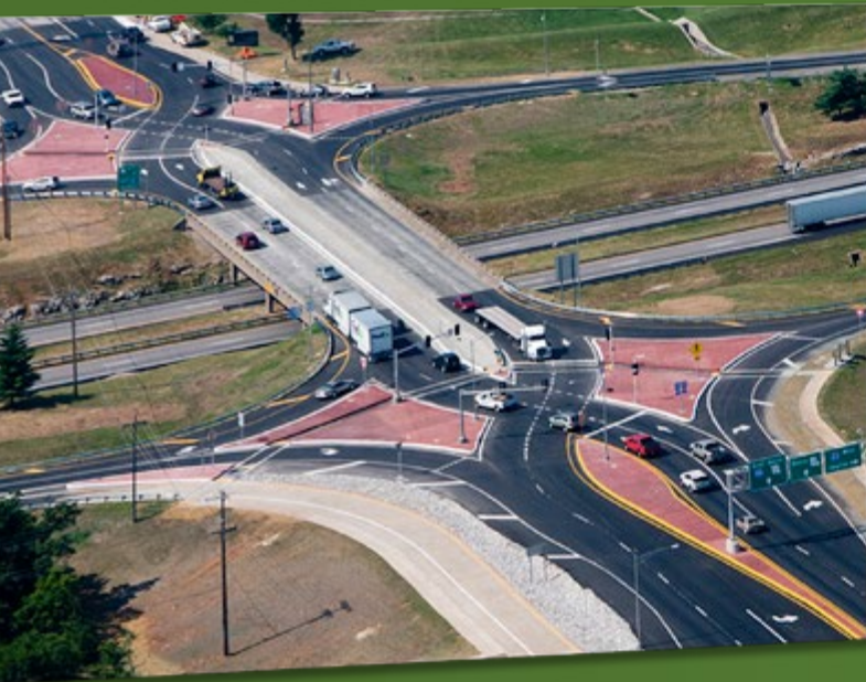
Diverging diamond interchange design enhances safety by reducing conflict points on interchanges.