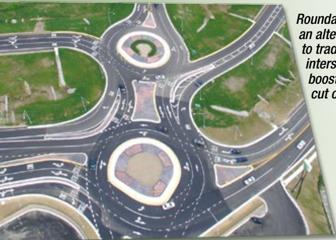
Roundabouts, an alternative to traditional intersections, boost safety and cut congestion.

In the construction manager-general contractor process, the project owner hires a contractor to provide feedback during the design phase. Once the design phase is complete, the contractor and project owner ne-