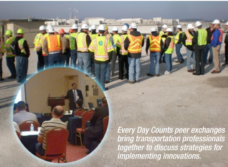
Every Day Counts peer exchanges bring transportation professionals together to discuss strategies for implementing innovations.