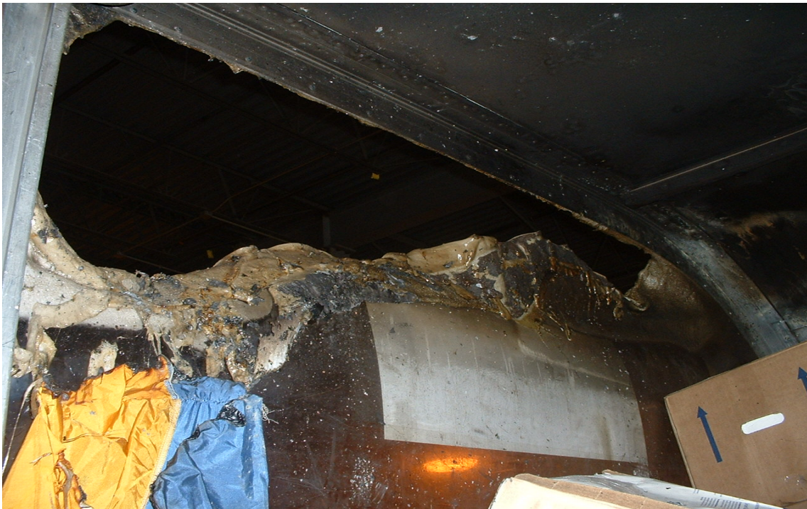
Figure 1. Damage to Cargo Container Caused by a Fire Involving Lithium Batteries

Since that time, several other incidents have occurred involving the shipment of lithium batteries in air cargo. Most recently, on August 7, 2004, a shipment of lithium batteries was involved in a fire at the airport hub of a major all-cargo carrier. The carrier's ramp personnel detected smoke coming out of a cargo container in the aft section of the aircraft. After the container, seen in Figure 1, was removed from the aircraft and placed on the ramp, the container burst into flames. The fire was traced to a package containing lithium batteries, as seen in Figure 2. The incident is currently under investigation by the National Transportation Safety Board.