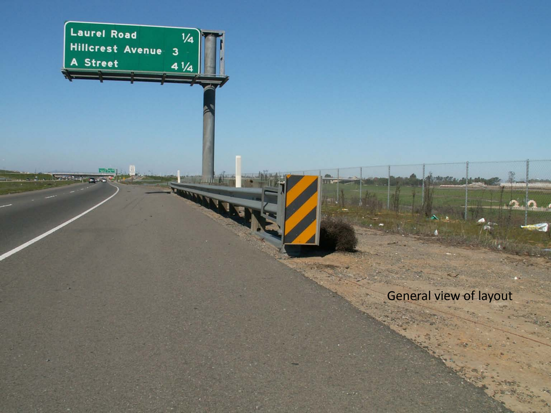
General view of layout

Laurel Road 1/4 Hillcrest Avenue 3 A Street 4 1/4