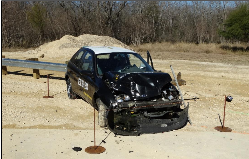
Figure 5: String Line for External Deformation

Before the vehicle was disturbed following the test, external deformation was measured relative to a string line that was positioned parallel to each side of the vehicle. The string was placed 122 cm (48 in.) from the centerline on both sides of the vehicle at a height of 45.7 cm (18 in.), and measurements were recorded from a vertical plane represented by the string line as shown in Figure 7 and Figure 8, and were made at each reference mark between the A-Pillar and B-Pillar. The measurements of external deformation are not used to determine compliance to NCHRP Report 350, and were recorded for reference only.