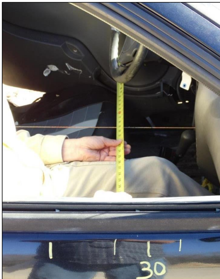
Figure 13: Representative Measurement of Driver's Side Compartment to Centerline