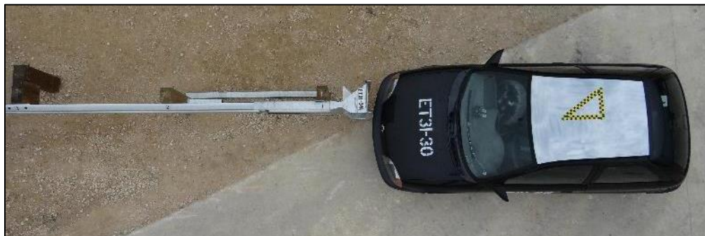
Figure 1: Vehicle Positioned for Test ET31-30, Pre-Test