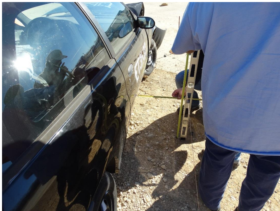
Figure 8: External Measurements - Passenger Side