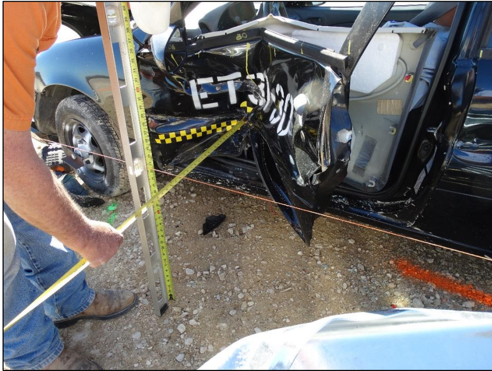
Figure 7: External Measurements - Driver's Side