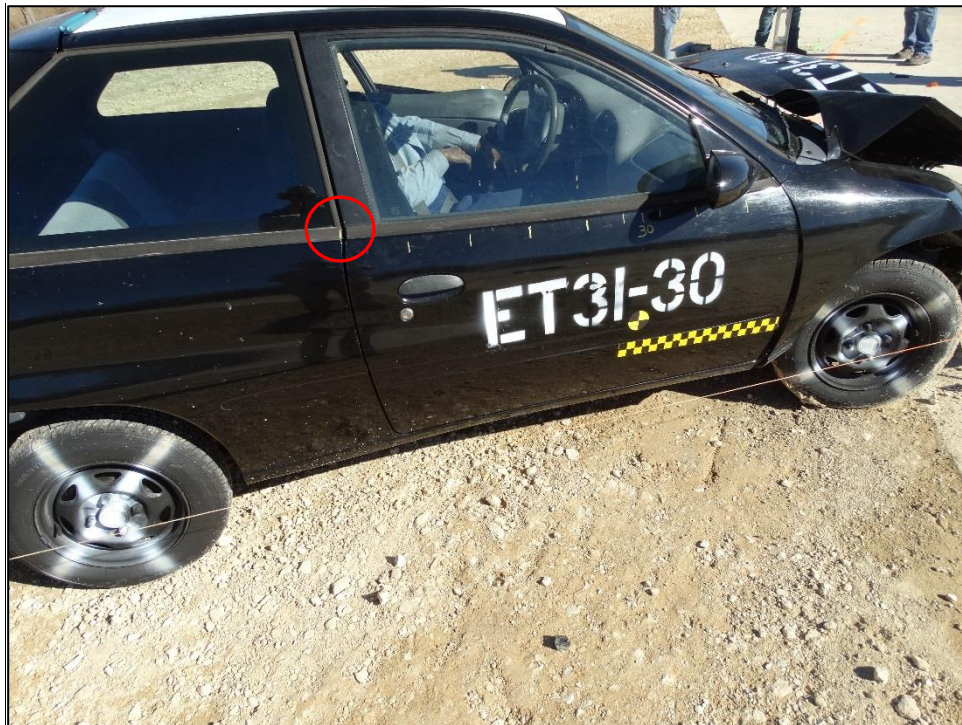
Figure 4: Exterior Reference Marks on Passenger Side Door, B-Pillar Forward

For both internal and external measurements, attention was focused on the front seat area of the vehicle. Reference marks were made on both sides of the vehicle starting at the B-Pillar as shown in Figure 4, and proceeding every 15.2 cm (6 in.) towards the A-Pillar at the front of the vehicle. In the area near the most significant damage, marks were made in 5.1 cm (2 in.) increments.