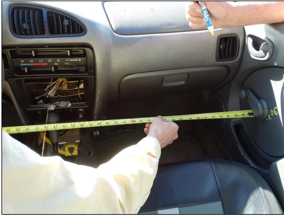
Figure 14: Representative Measurement of Passenger Side Compartment to Centerline

Following the test, internal measurements were made at each of the longitudinal reference marks between the A-Pillar and B-Pillar, and the maximum relative reduction was noted at the lower front corner of the map pocket on the driver's side door, shown in Figure 15. To measure the relative deformation at this location, the top edge of the loose trim on the map pocket was pressed against the door panel as shown in Figure 16, and the resulting measurement to the centerline was compared to the measurement for the corresponding corner of the map pocket on the passenger door. The maximum post-test occupant compartment deformation at the point of maximum compartment reduction was measured to be approximately 17.1 cm (6.75 in.) at a point located approximately 2.2 cm (0.85 in.) below the center of gravity and approximately 5.1 cm (2 in.) aft of the radio panel, roughly even with the height of the front edge of the seat. This measurement equated to a reduction in the width of the occupant compartment of 14% and an Occupant Compartment Deformation Index 1 (OCDI) rating of LF0000200. Note that all measurements with the exception of the location of maximum reduction were made at the height of the centerline string.