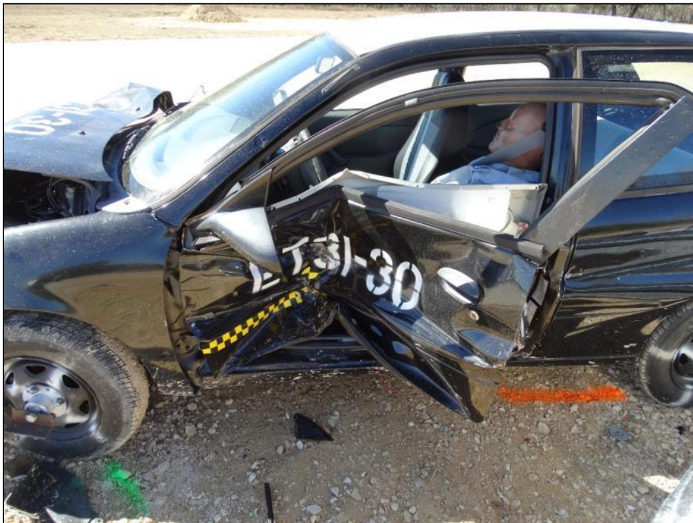
Figure 3: ET31-30 Test Vehicle Post-Test, Driver's Side Exterior