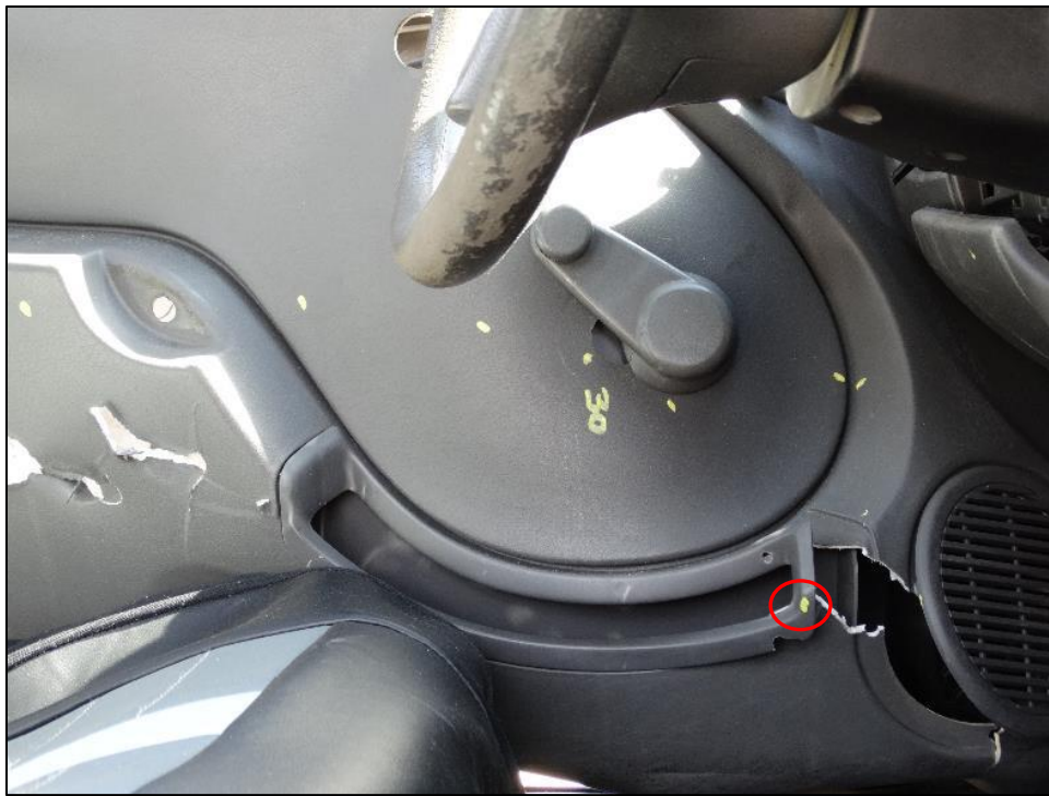
Figure 15: Location of Maximum Occupant Compartment Deformation