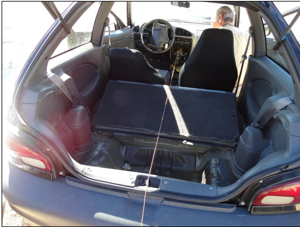
Figure 11: Centerline Strung from Radio Panel to Rear Hatch Latch

These dimensions were later used to relate the location of maximum deformation to the vehicle's center of gravity.