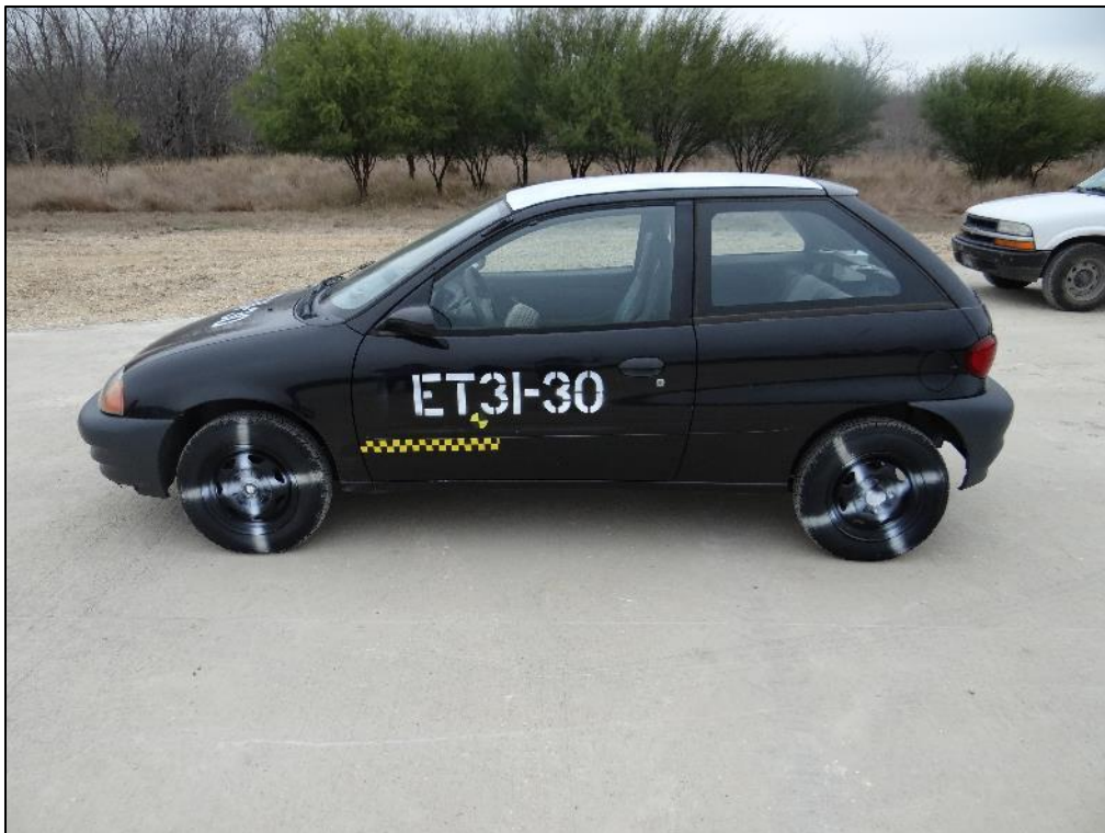
Figure 2: Test ET31-30 Vehicle, Pre-Test