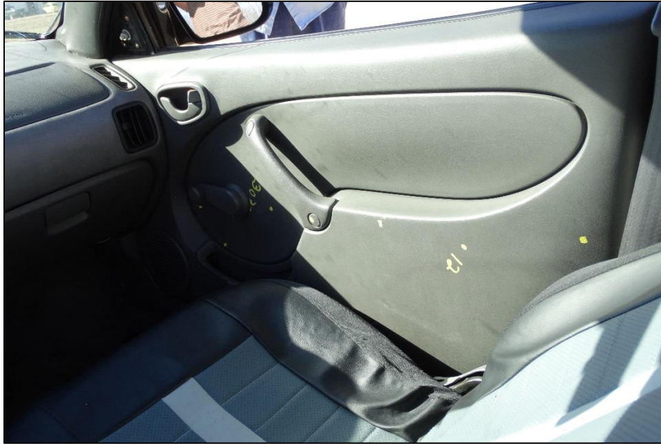
Figure 9: Reference Marks Transferred to Interior Passenger Side Door Panel

Prior to taking interior deformation measurements, the anthropomorphic dummy was removed from the driver's seat of the vehicle through the passenger door to ensure minimal disturbance of the driver's side door. The reference marks shown in Figure 4 were transferred to the interior of the vehicle on the passenger side as shown in Figure 9, and then to the associated location on the driver's side door as shown in Figure 10. Measurements for both the driver and passenger side of the vehicle were made at each of these reference marks.