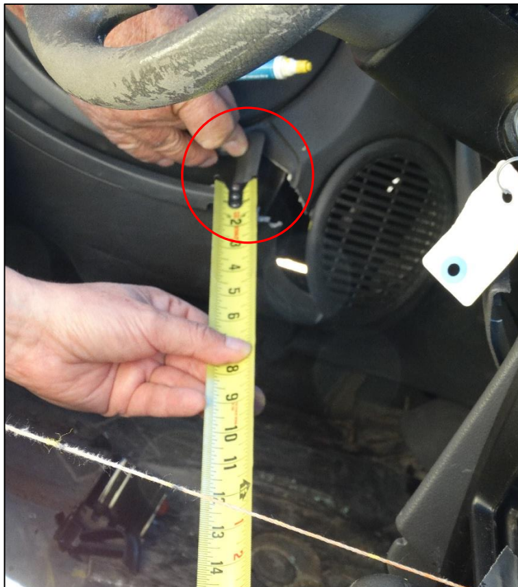
Figure 16: Top Corner of Map Pocket Trim Held against Door Panel for Measurement