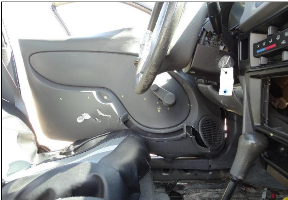
Figure 10: Corresponding Reference Marks on Driver's Side Door Panel