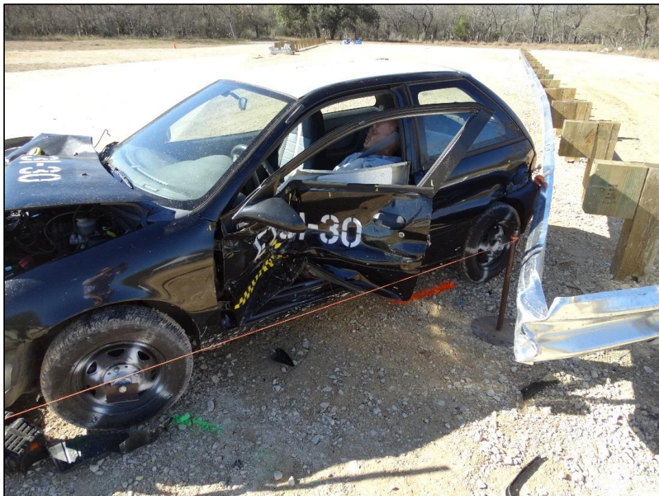
Figure 6: Reference String on Driver's Side