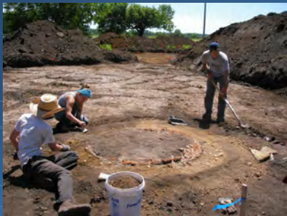
A programmatic agreement reduced the time required to clear this Euro-American-tradition archaeological site on the Olympian Drive project, north of Champaign and Urbana, IL.

In general, PAs set procedures for consultation, review, and compliance with Federal laws. PAs allow repetitive actions to be handled on a program basis rather than on a project-by-project basis.