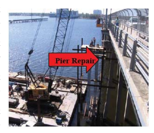
Figure 6. I-110 Bridge Repair

awarded to shore up a single pier on the I-110 Bridge (see Figure 6). After the T.L. Wallace contract was awarded and before the work started, FHWA questioned the lump-sum method used by MDOT and the price of the work. FHWA Division officials told us that it was MDOT's initial intention to negotiate a sole-sourced contract with T.L. Wallace. FHWA agreed to this type of procurement because T.L. Wallace had the workforce and equipment that could be mobilized easily to make needed repairs to the damaged pier at the I-110 Bridge. FHWA officials also stated that they expected and would have preferred MDOT to award a cost-plus contract for the repair work at the I-110 Bridge.