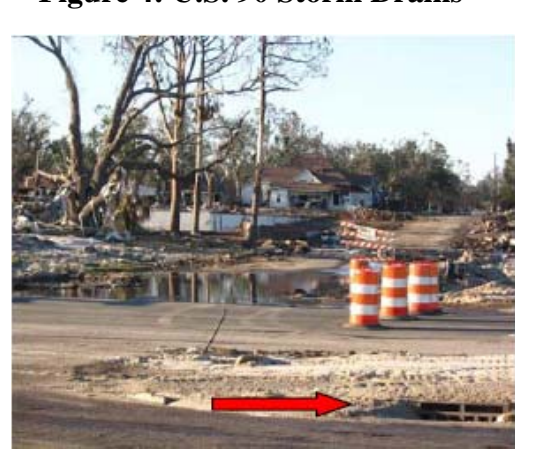
Figure 4: U.S. 90 Storm Drains

The negotiated, cost-plus contracts required contractors to submit progress billings to support labor, equipment, and other costs that were used to clear debris and clean the storm drains on U.S. 90 (see Figure 4). To evaluate the contractors' billings, MDOT's project offices maintained records on labor and equipment usage, while its audit department independently reviewed progress bills by checking supporting invoices for the reasonableness of labor rates and possible duplicate charges between contracts. confirmed that MDOT's audit activities identified some labor improper and equipment charges that resulted in it making adjustments to contractors' billings.