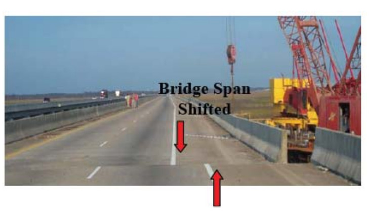
Figure 3: I-10 Bridge Repair at Pascagoula

The timely hurricane. completion of this repair was significant to the entire Gulf Coast region, as this bridge was a vital part of the I-10 highway system that provided a critical east-west link needed to carry food, water, medicine, clothing, and emergency personnel to devastated areas of Mississippi and Louisiana. Just after the hurricane, traffic could travel on the eastbound lanes because major segments of the