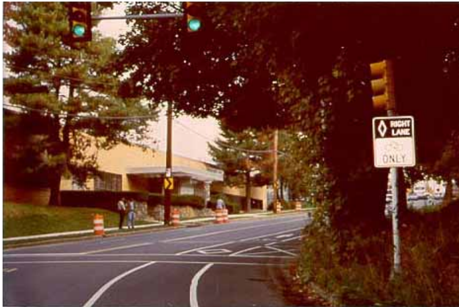
Figure 4-1. Photo. Group B (basic) bicyclists value designated bike facilities such as bike lanes.