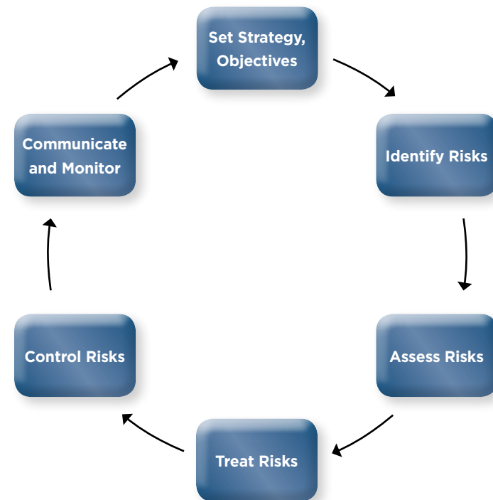
Figure 2. The cyclical steps of risk management

The above steps provide for the cyclic, ever-improving type of process illustrated in Figure 2. It shows that risk management when comprehensively applied leads to a “learning process” where the results of risk mitigation and opportunity