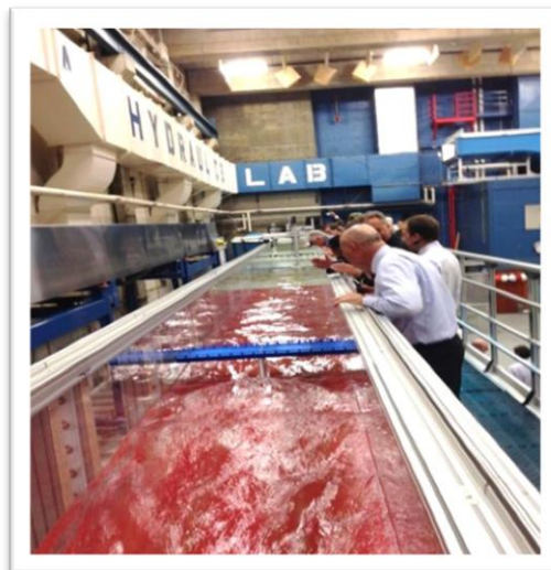
Water flows into the flume and streams beneath a small scale bridge.

The recirculating system allows for sediment infed from the bottom of the flume channel sections. The flume system will support the