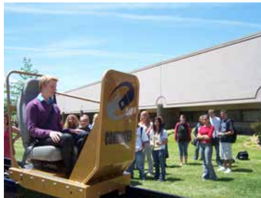
Novice drivers are 'convinced' to wear their seat belt with the NHP Convincer

The youth driving program formerly known as PACE, now as STARS (Supporting Teens and Roadway Safety) continues strong. The number of teams for this program and the recognition for this program grows statewide.