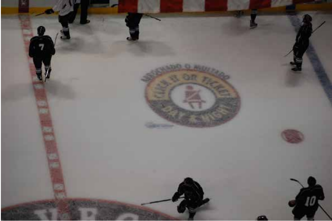
'Click it or Ticket' 'under the ice' at the Las Vegas Wranglers Hockey Stadium

In addition, four press conference 'kick-off' events were held (2 each in the north and south) Earned media for this campaign generated 5,574 seconds of 'free' air time equaling approximately $56,486 in ad value and reaching well over two million people (Nielsen Audience rating).