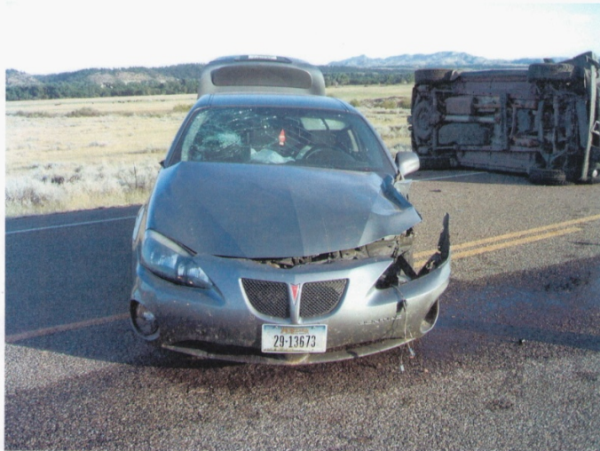
Alcohol related motor vehicle crash – No serious injuries both parties were wearing their seatbelts.

Bureau of Indian Affairs Highway Safety Program