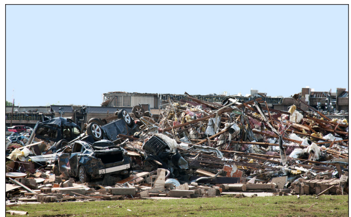
Figure 2: Tornado Damage in Moore, Oklahoma.

Russell Perkins/Oklahoma Department of Transportation