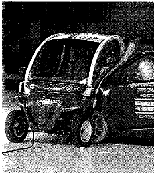
Exhibit 9: A Smart Car Impacting the Side of a GEM e2 Vehicle at 31 mph

belted dummy's head came close to hitting the Smart's windshield. The GEM dummy had injury measures indicating serious or fatal injury for real occupants," IIHS said.