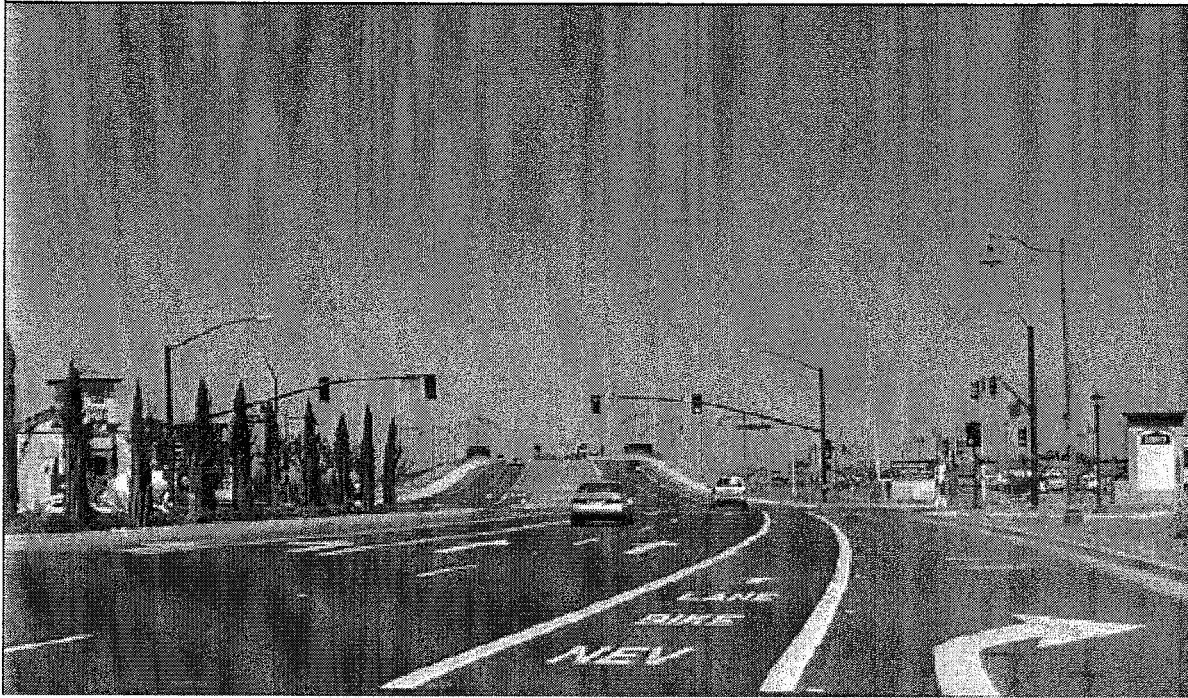
Exhibit 10: Roadway in Lincoln, CA Marked for NEV Use

NHTSA notes that as of the date of the Lincoln report to the California legislature there were no safety related incidents involving NEVs in areas where the plan had been implemented, according to the report. However, the City of Lincoln's NEV Transportation Plan was far short of being fully implemented as of the date of the report.