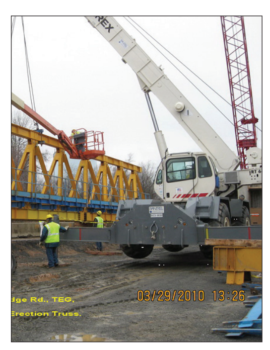
Dulles Corridor Metrorail Project construction, Northern Virginia

estimates project the BAB subsidies at $3 billion per year versus previous estimates of about $1 billion a year.