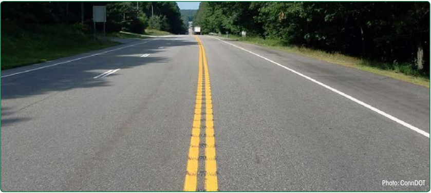
FIGURE 1. Center Line Rumble Strips

Center line rumble strips (shown in Figure 1) can prevent head-on collisions and opposite-direction sideswipes, which are often referred to as cross-center line crashes.