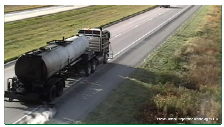
FIGURE 8. Fog Seal Application

All rumble strips are essentially "self-cleaning," as snow, ice, rain, or sand do not typically remain for any length of time; this is attributed to the wind created by passing vehicles. Milled rumble strips typically require little to no maintenance.8 Missouri, South Carolina, Pennsylvania, and Washington DOTs all reported no use of preventative maintenance treatments on their rumble strips. According to a technical advisory from FHWA in 2011, asphalt fog seals can be used over milled-in rumble strips where there are deterioration concerns, as shown in Figure 8. The purpose of fog sealing rumble strips is to reduce oxidation and moisture penetration into the pavement.9 Although fog seals have been commonly used over rumble strips in the past, many States have discontinued using them due to a lack of documented findings that prove added value to pavement life. South Carolina DOT also reports that fog seals proved to be incompatible with thermoplastic pavement markings.<sup>10</sup> Similarly, Missouri DOT reported that the fog seal was unnecessary when installing rumble stripes because the rumble strip is sealed by the pavement marking paint. 11 Keep in mind that raised rumble strips do require maintenance, particularly those that include raised pavement markers that can become loose over time.