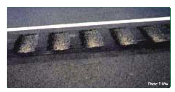
FIGURE 4. Example of Milled Rumble Strips

Milled rumble strips are made by a machine with a rotary cutting head that creates a consistent shape and size groove into the pavement. An example of milled rumble strips can be seen in Figure 4.