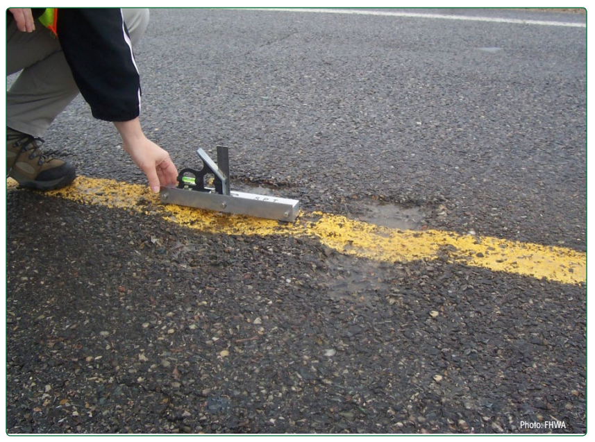
FIGURE 5. Measuring Milled Rumble Strips

The milling machine head used to install rumble strips can be modified to cut the exact desired dimensions, spacing, and shape of agency-specified rumble strips into the pavement. As with any construction operation, having an agency inspector and the contractor together at the onset of the milling operation is a key to successful rumble strip installation. Inspectors should be aware that the effective depth of the rumble strip is measured to the highest point within the bottom of the groove, the depth to which the tire will drop, rather than to the lower surfaces where the milling teeth cut, as illustrated in Figure 5. Inspectors also need to consider where measurements will be taken if different slopes are involved. In sections with crown, center line rumble strips will be deepest at the center if the tires of the milling machine straddle the crown, or may taper off on one side significantly if both tires are to one side.