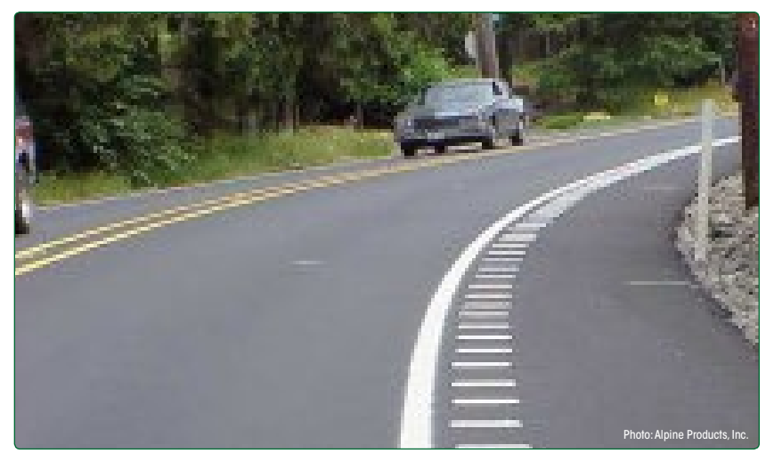
FIGURE 7. Example of Raised Rumble Strips

In terms of the length of time it takes to install rumble strips, several contractors report being able to place between 2.5 and 4 miles of rumble strip per hour, resulting in the application of 20 to 32 miles of rumble strips in an 8-hour workday.