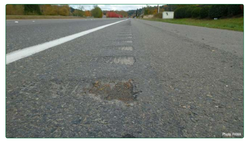
FIGURE 6. Poor Results Due to Differing Cross Slopes

This can also occur on shoulder rumble strips if the shoulder has a different cross-slope than the main line, as shown in Figure 6. Together, the inspector and contractor can assess different milling techniques to meet the needs of the site conditions.