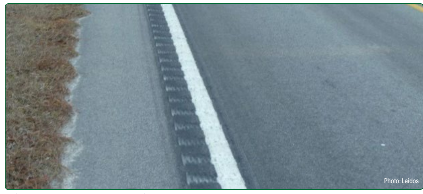
FIGURE 2. Edge Line Rumble Strips

They are primarily used to warn drivers who are drifting into an opposing travel lane. While they are most often used on rural two-lane, two-way roadways, they can also be applied to multilane undivided facilities. Center line markings are typically placed on center line rumble strips, which have an added benefit of improving the visibility of the marking in wet conditions. Center line rumble strips have been shown to reduce head-on and opposite-direction fatal and injury crashes by 45 percent on rural two-lane roads.<sup>3</sup>