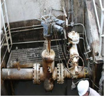
Page 8 of 13