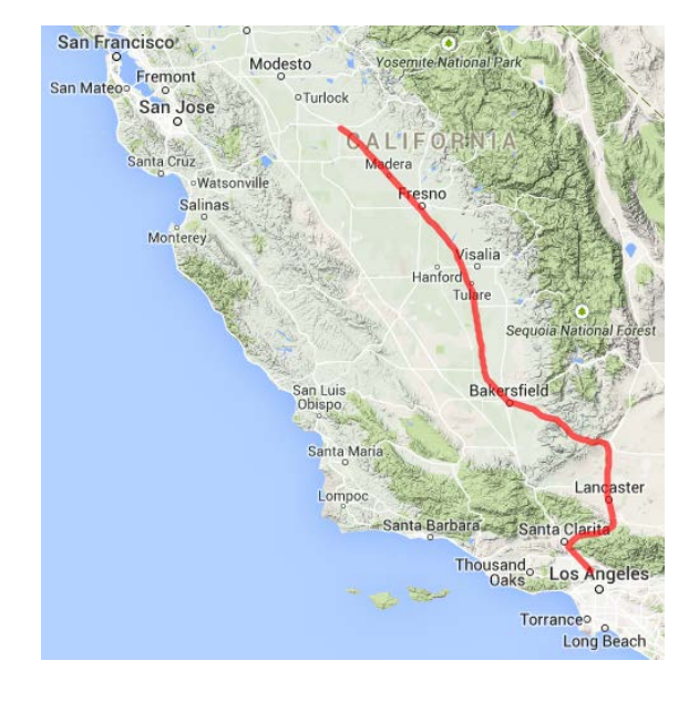
EXHIBIT B. SUMMARIES OF SELECTED GRANTS