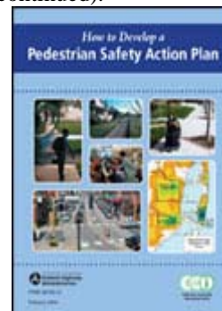
How to Develop a Pedestrian Safety Action Plan

The FHWA Safety Office hired PBIC to develop a comprehensive guide to provide a framework for state and local agencies to develop and implement a pedestrian safety action plan tailored to their specific problems and needs. How to Develop a Pedestrian Safety Action Plan helps state and local officials know where to begin to address pedestrian safety issues. It is also intended to assist agencies in further enhancing their existing pedestrian safety programs and activities, including identifying safety problems, analyzing information, and selecting optimal solutions. The guide contains info. on how to involve stakeholders, potential funding sources for implementing projects and how to evaluate projects (continued).