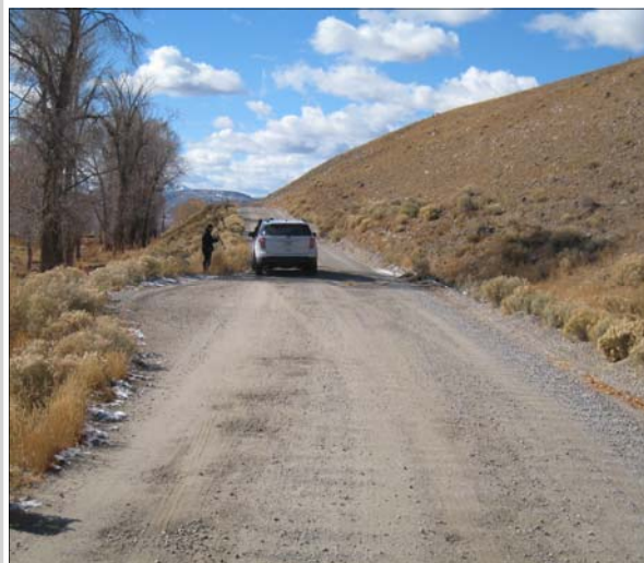
National Elk Road, Pre-Construction