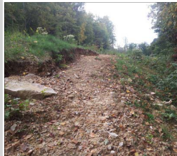
Piney Creek Trail, WV