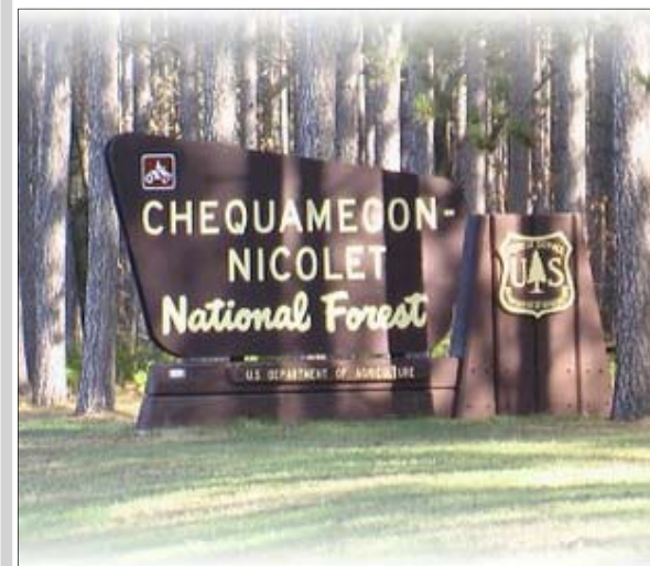
Chequamegon-Nicolet National Forest entrance, WI