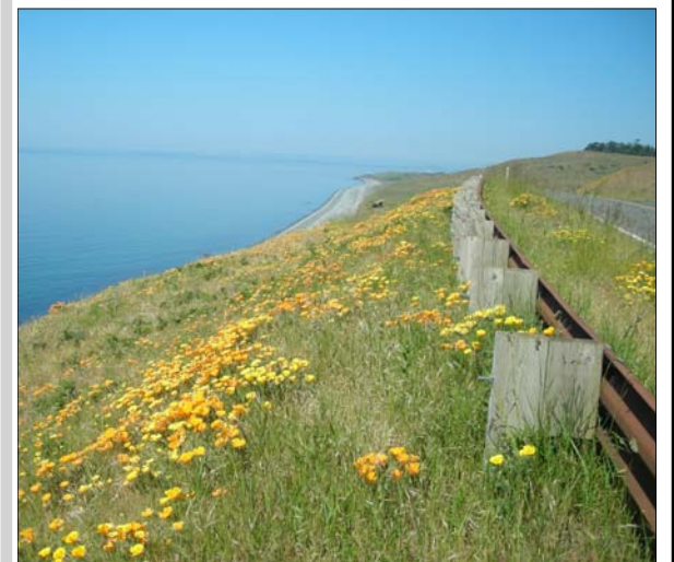
Cattle Creek Road, San Juan Island, Washington