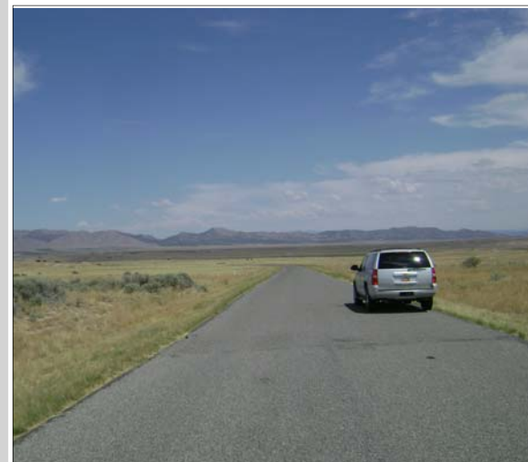
Little Sarah Project, Pre-Construction