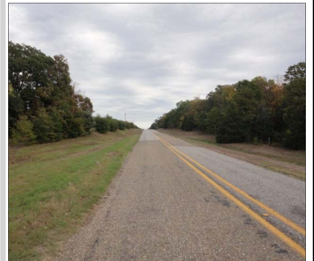
FM 409 Rehab Widening Project, Pre-Construction