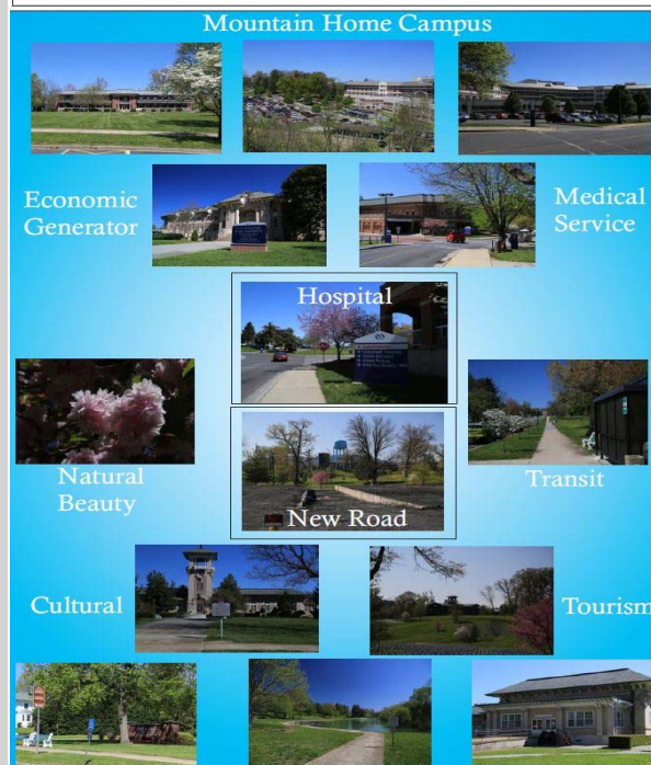
Veterans Affairs Hospital Connector, Tennessee