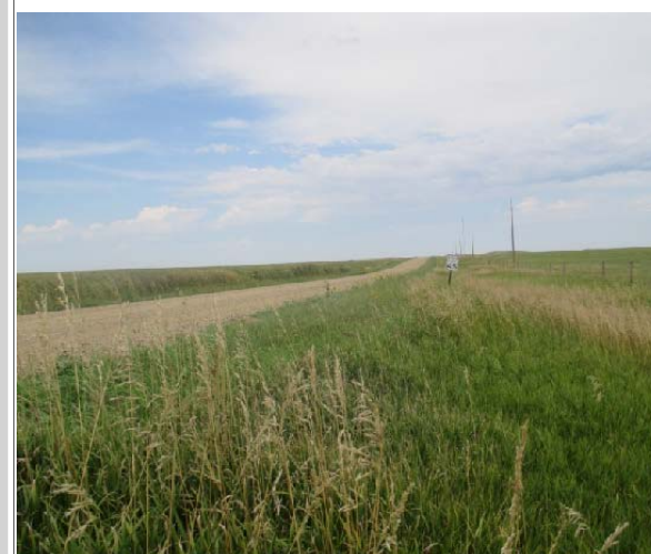
Cottonwood Road, Pre-Construction