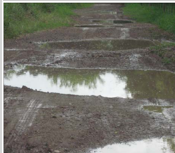
Current Condition of the Access Rd to Laguna Cartagena NWR