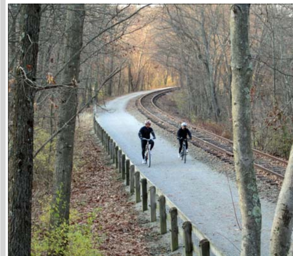
Heritage Rail Trail, York County, PA

The work will consist of constructing a prefabricated bridge to cross Willis Run and 10-foot wide, crushed stone pathway on the grass covered levees. A special clay/gravel mix, Nature Trail Path-Mix, which is quarried in York County, will be used for the crushed stone pathway. The trail will also be designed to meet ADA standards. The drainage system will consist of stone and perforated pipe to allow for on-site natural percolation of storm water. If there are existing culverts, they will be upgraded to accommodate additional runoff. Standard fencing (hand railing) will be installed to protect the public from sudden grade changes.