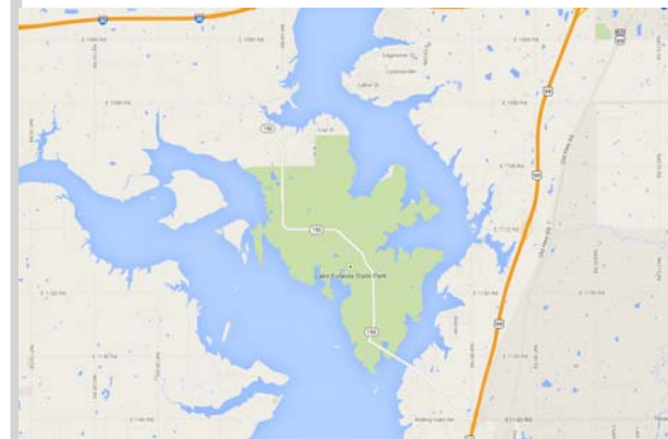
Lake Eufaula State Park, Oklahoma