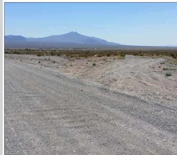
Corn Creek, Pre-Construction