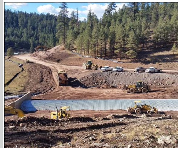
Cuba la Cueva, During Construction activities on 26 ft span by 13 ft rise structural plate culvert