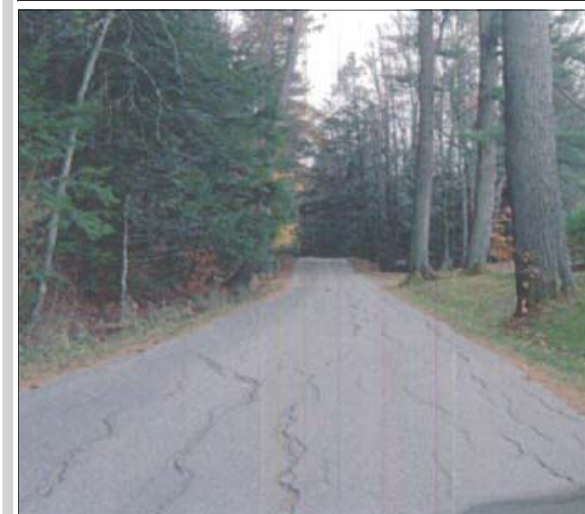
Current View of Saint Gaudens Road