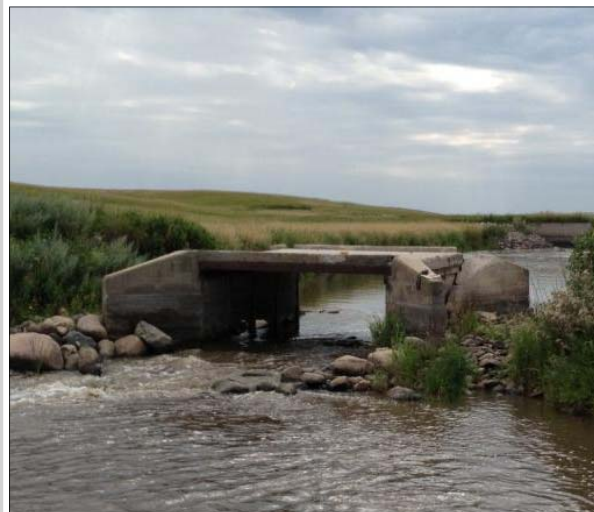
Brecker Bridge, Pre-Construction