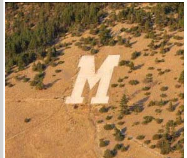
Bozeman to Bridger Mountains Trail, Gallatin N.F., Montana