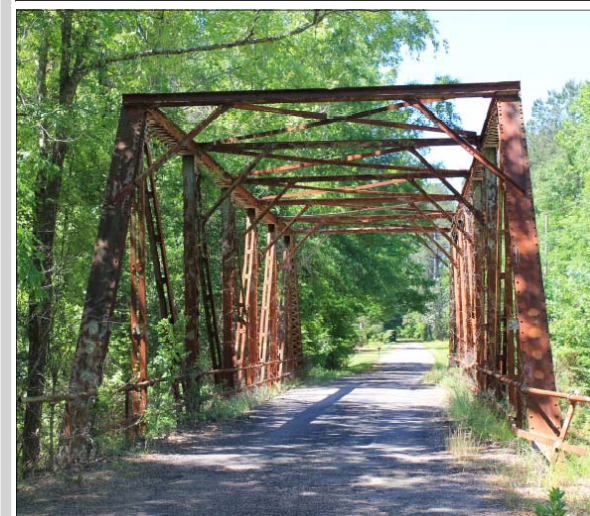
View of Bridge #26 located at Middleton Creek Road