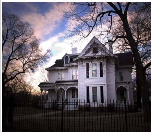
Harry S Truman National Historic Site, Grandview, MO