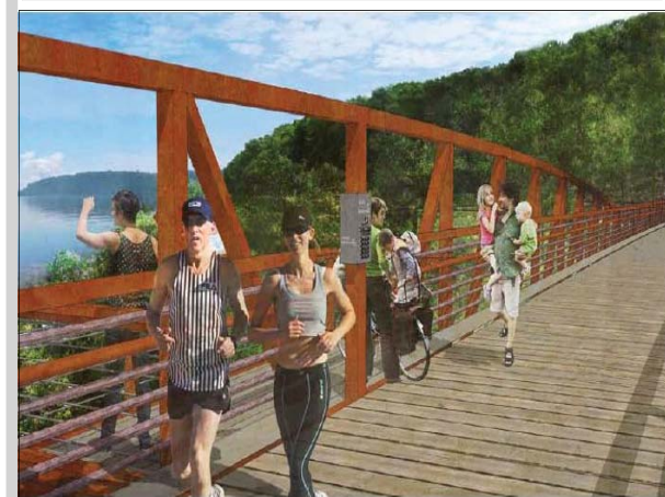
MISSISSIPPI RIVER REGIONAL TRAIL SPRING LAKE PARK RESERVE