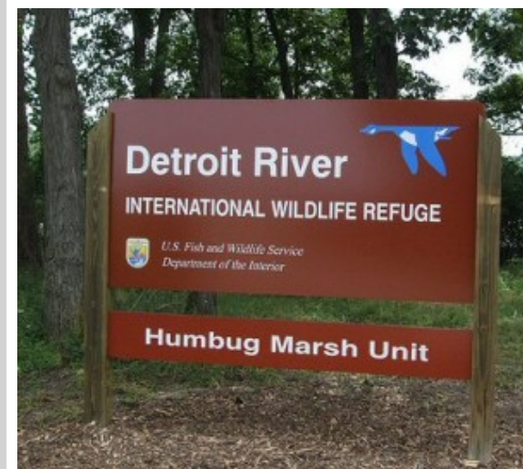
Detroit River International Wildlife Refuge's entrance, Michigan.