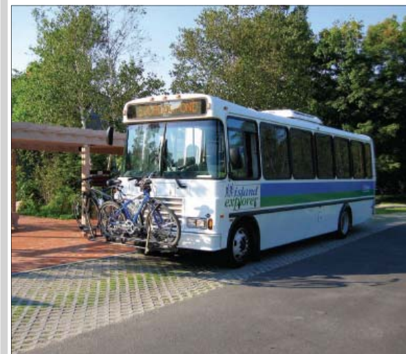
Island Explorer Shuttle