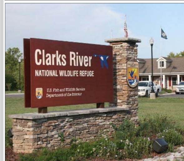
Clarks River National Wildlife Refuge, Kentucky