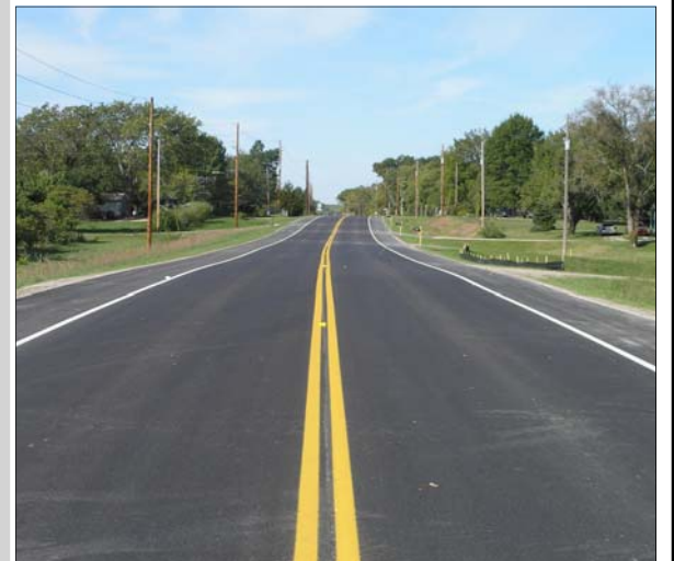
North 1200 Road Widening, Post-Construction